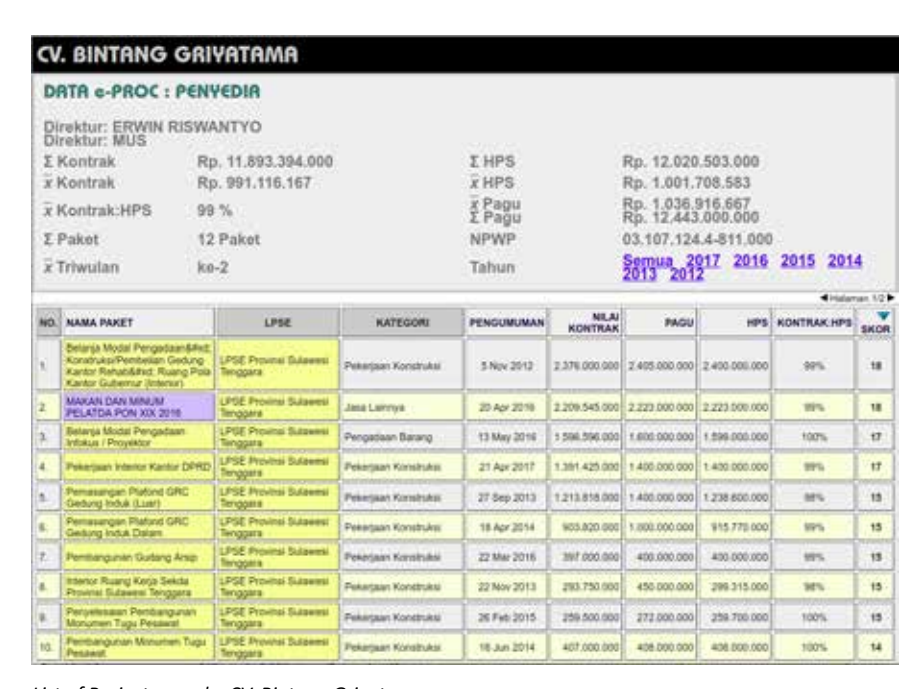
List of Projects won by CV. Bintang Griyatama